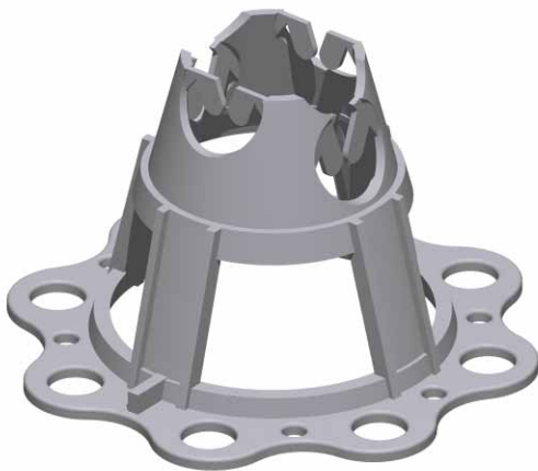
Up to a #5 Rebar and Mesh

The Mesh Bar Chair with Base (MBCB) is a light duty, composite chair with sand plate for use on soft surfaces and/or slab on grade to correctly position and hold the wire mesh securely in place. Each size chair is designed to service two mesh positioning heights. It is available in heights from 5/8" to 6". It can be used to support up to a #5 rebar.