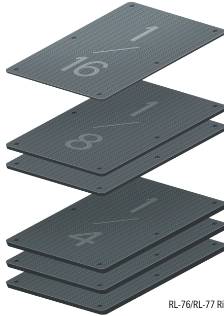
RL-76/RL-77 Ridged Shims

Meadow Burke shims are made in America and are designed to quickly and safely adjust for a variety of uneven footing or panel situations. They provide excellent stability and will not rust or stain the concrete.